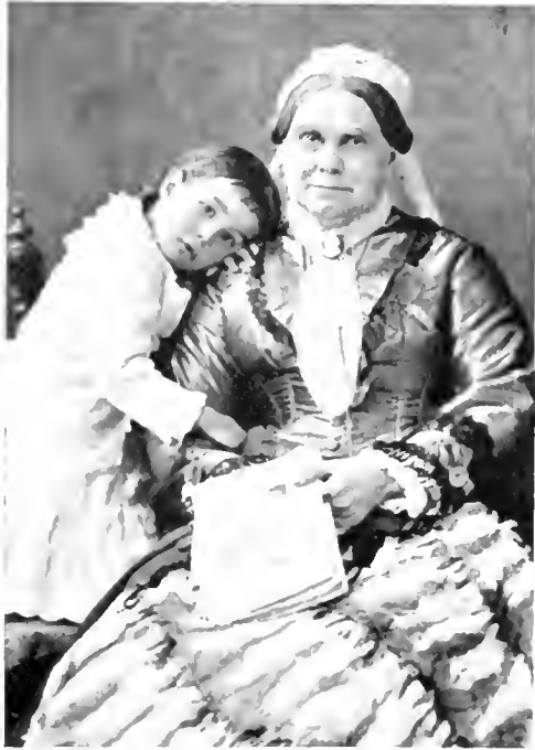
ELIZABETH BUFFUM CHACE.

CHAMPNEY, Mrs. Elizabeth W., author, born in Springfield, Ohio, 6th February, 1850. Her father was Judge S. B. Williams. She was educated in Vassar College and was graduated in 1869. During her girlhood she dreamed of literature as a profession, and she wrote many romances that were never printed. In 1876 she began to publish short stories, poems and romances in large numbers. She contributed to "Harper's Magazine" and the "Century" a series of observations on her travels in England, France, Spain, Portugal and Morocco, as well as other oriental lands. Among these papers was a striking one on Portugal, another on "A Neglected Corner of Europe," and a third, "In the Footsteps of Fortuny and Régnauld." Since her return to the United States she has written about a score of volumes. Her novels are "Bourbon Lilies" and "Rosemary and Rue." Her stories for youth include "All Around a Palette" and "Howling Wolf and His Trick Pony." Among her historical stories for youth is "Great-Grandmother Girls in New France," suggested by the Indian massacre in Deerfield, Mass. One of her most successful works is "Three Vassar Girls Abroad," which consists of ten volumes. Mrs. Champney writes much on solicitation by publishers, and her time is thus too much taken up to permit her to indulge her bent and talent for poems and short stories. Her popularity has dated from